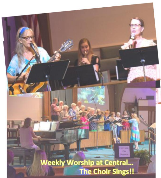
Weekly Worship at Central... The Choir Sings!!