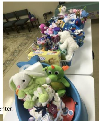
Pictured (left) are the baskets our MOPS moms made for needy moms at the Women's Resource Center.