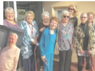
Central's Active Seniors

The Halifax Herald A Publication of Central Baptist Church 142 Fairview Avenue, Daytona Beach, FL 32114 This newsletter may be viewed online at www.centralbc.org Email: info@centralbc.org (386) 255-2588 Office Hours: Mon-Thur.: 8:30 a.m - 5:00 p.m. Fri.: 7:30 a.m - 4:00 p.m. Closed Daily for Lunch: 12:30-1:30 p.m.