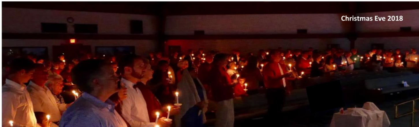
Christmas Eve 2018