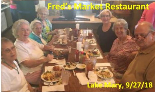
Lake Mary, 9/27/18