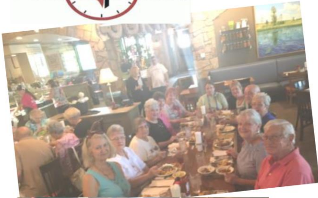
Fred's Market Restaurant