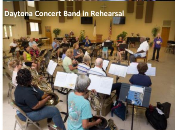
Daytona Concert Band in Rehearsal