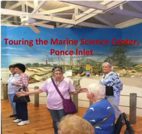
Touring the Marine Science Center, Ponce Inlet