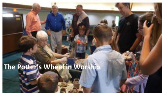
The Potter's Wheel in Worship