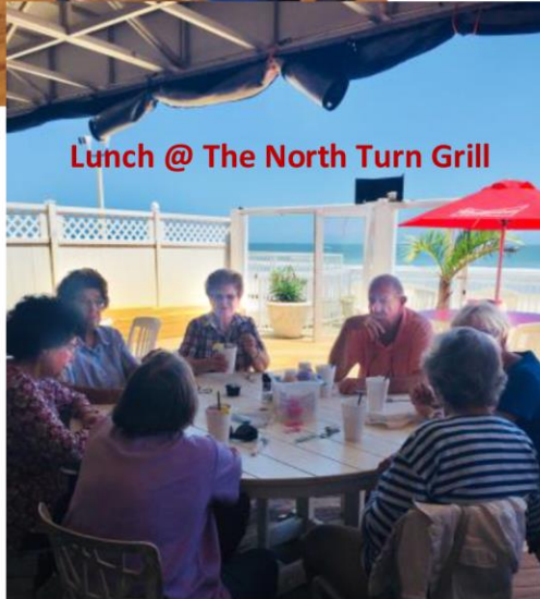
Lunch @ The North Turn Grill