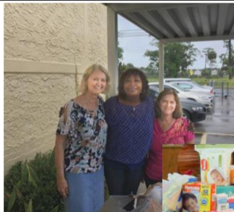
Mothers' Day Shower Gifts for Chiles Academy

Periodical Postage Paid at Daytona Beach, FL 577360