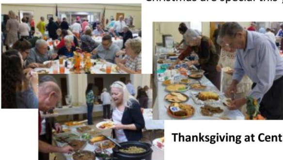
Thanksgiving at Central, 11/19/17