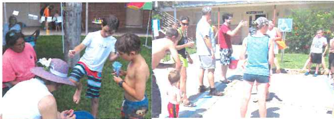
Wet and Wonderful Fun—Prelude to a Summer of FUN at Central