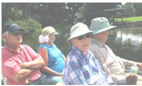
Pictured here: A recent trip to Winter Park by Sunrail and subsequent boat tour.

There will be another gathering at the newly renovated Museum of Arts & Science on Tuesday, September 6., followed by lunch at Golden Corral in Port Orange. The museum tour is free that day for Volusia County residents; those riding the bus need to sign up to ensure a space on the bus.