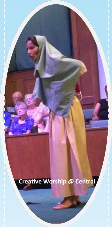
Creative Worship @ Central